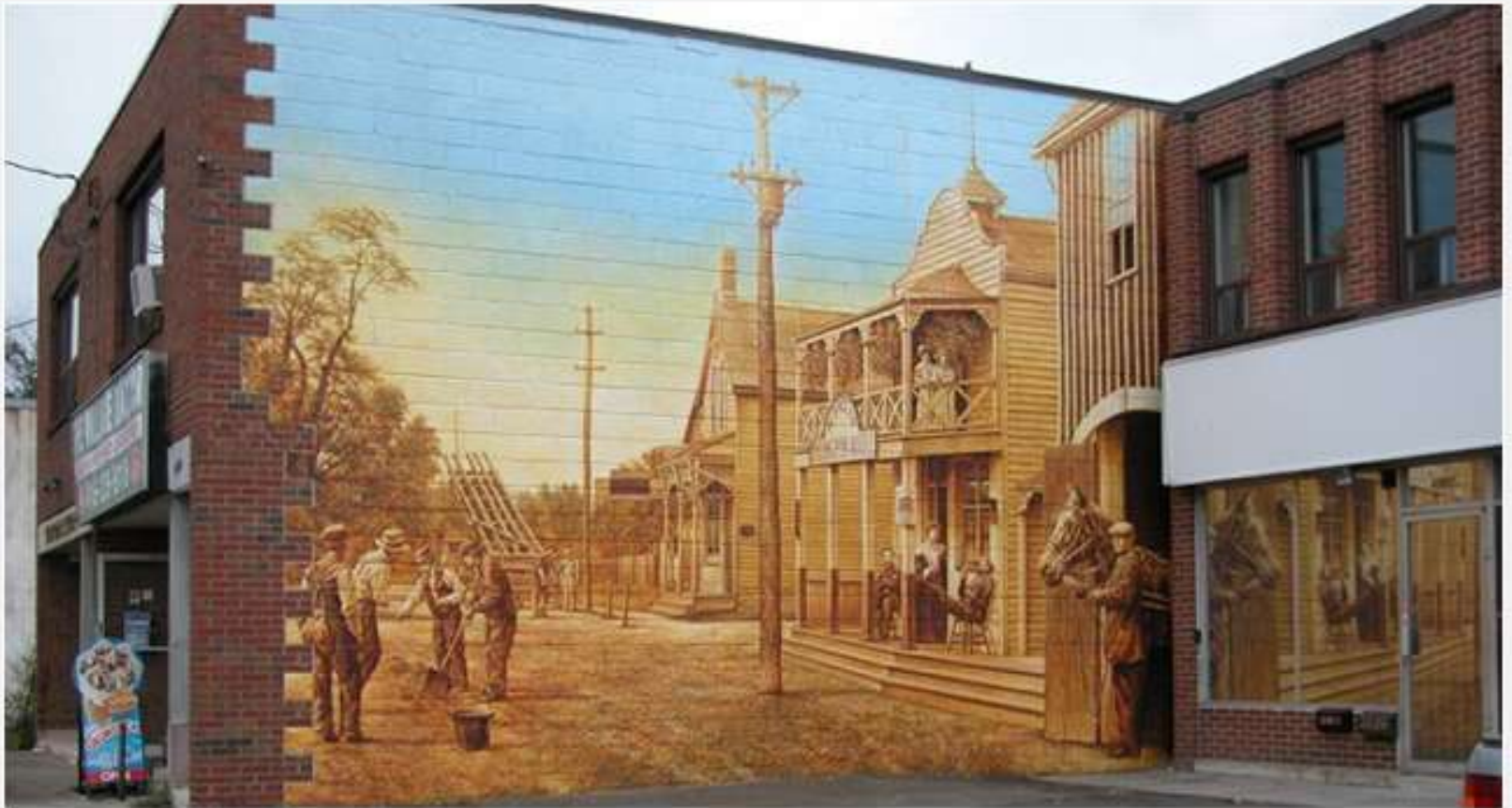
"THE WAY WE WERE, PART 2" AT 4984 DUNDAS. MURAL BY JOHN KUNA, 2006